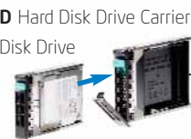
D Hard Disk Drive Carrier