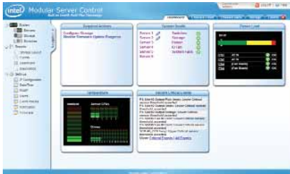
The Dashboard gives an overall system status view within the Modular Server Control