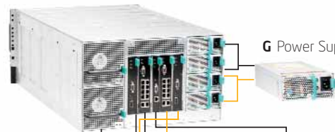
G Power Supply Module