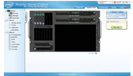
The Virtual Presence Modular Server Control allows you to see the components you physically have loaded in your system—even if they are powered down