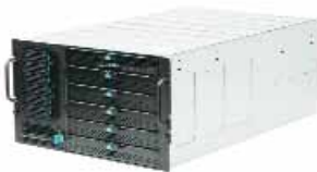
A Chassis: Option A Front