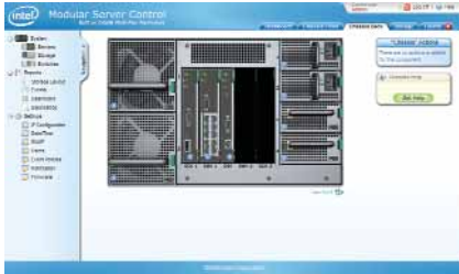
The back view of the chassis allows you to see the status of your modules and power supplies