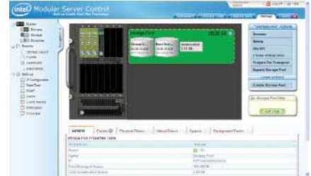
Under the Storage Configuration window, you can create storage pools and virtual drives, as well as map virtual drives to multiple servers using the Intel® Shared LUN feature